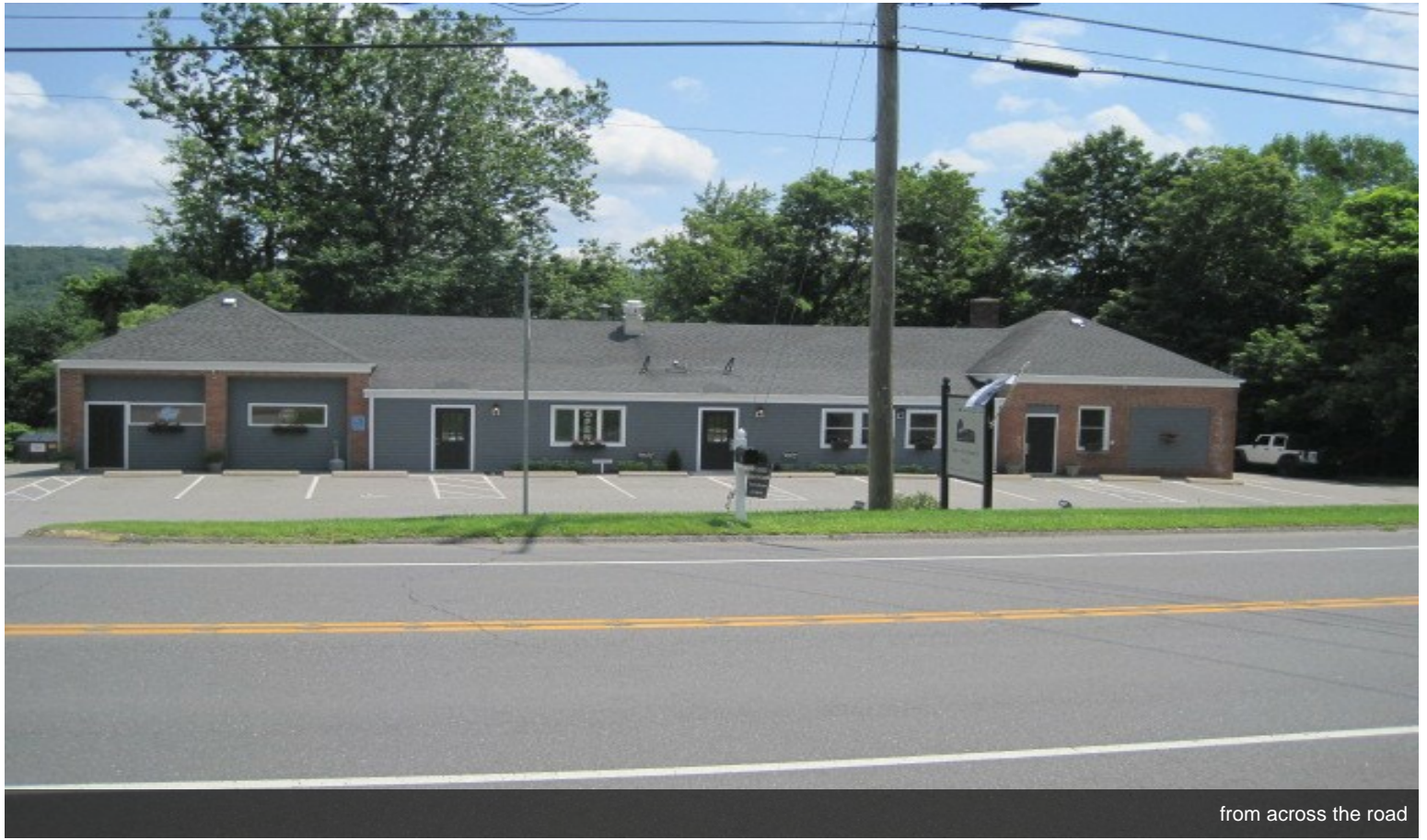
from across the road