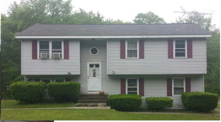
Two Family house